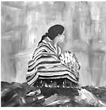
"Behold, I make all things new"

Advent reflection booklets are available (free of charge) in the Church fover today. These are suitable for personal reflection, or you might like to meet with others for group reflection.